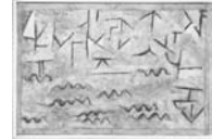
Der Rhein bei Duisburg Paul Klee

Cover art: Detail of Der Rhein bei Duisburg , 1937, 145(R 5) Rhine near Duisburg 19 × 27.5 cm; water-based on cardboard; The Metropolitan Museum of Art, N.Y. The Berggruen Klee Collection, 1984. (1984.315.56) © 2003 Artists Rights Society (ARS), New York / VG Bild-Kunst, Bonn