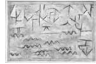
Der Rhein bei Duisburg Paul Klee

Cover illustration: Detail of Der Rhein bei Duisburg , 1937, 145(R 5) Rhine near Duisburg 19 × 27.5 cm; water-based on cardboard; The Metropolitan Museum of Art, N.Y. The Berggruen Klee Collection, 1984. (1984.315.56) © 2003 Artists Rights Society (ARS), New York / VG Bild-Kunst, Bonn