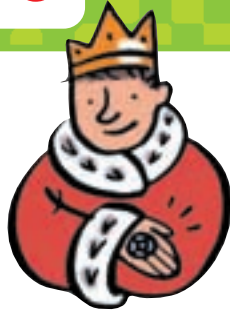
The king has a ring.