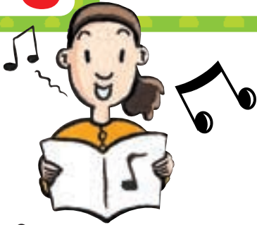
Sue sings a song.